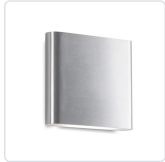
AT6506-BN-UNV Brushed Nickel